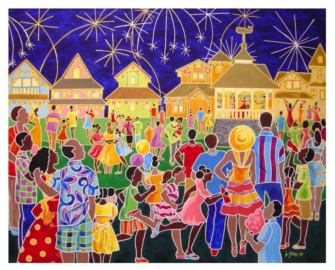
"Juneteenth at Oak Bluffs" by Sonia Sadler. Used with permission from Inez Sadler.