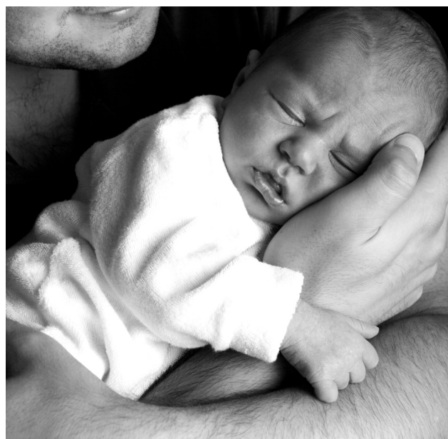
A father holds his baby.

How do you honor people who have passed? How do you express gratitude? (See the essay on the next page.)