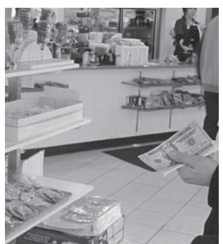
I felt happy when the customers bought what I made.