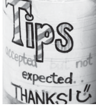
They gave me tips and said, "Thank you."