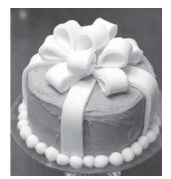
I enjoyed decorating cakes.