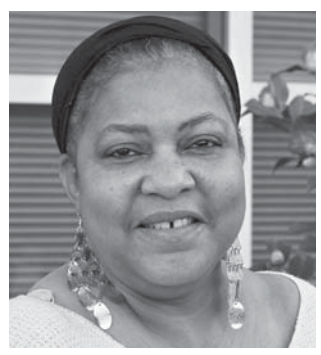
Corner Bakery was a great place to work. Now I am studying for the GED.