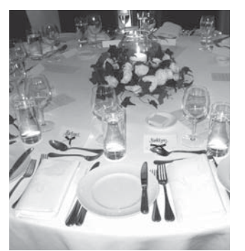
Sometimes we worked at special events. I made the tables look beautiful.