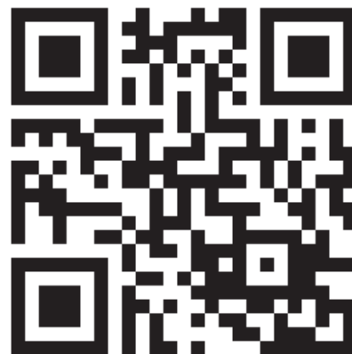
Use your phone or tablet to read this QR code. Where does it take you?

Watch a video on how to make your own QR code here: < www.youtube.com/watch?v=tiJC4e2q4Ds >.