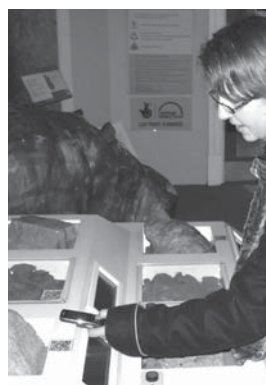
Top image: NY uses QR codes to update passengers. Bottom: scanning a QR code at a museum.