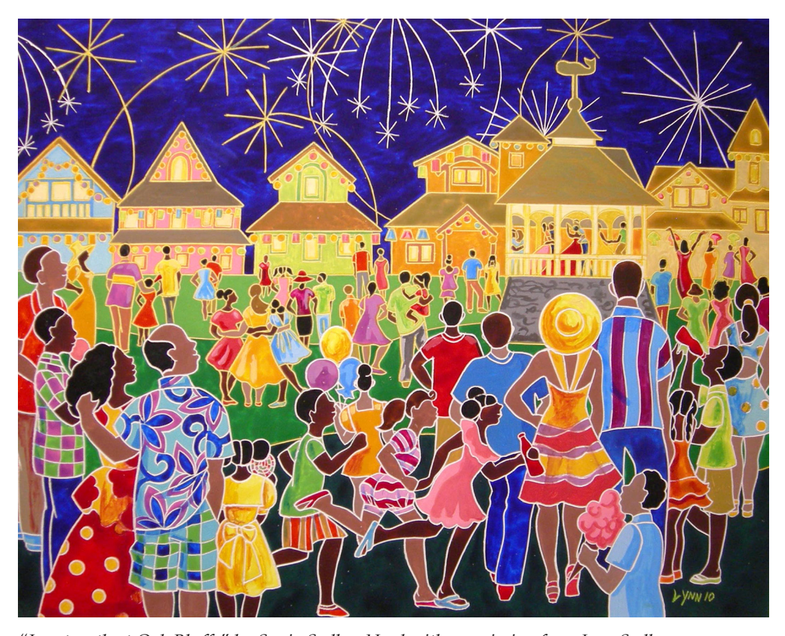
"Juneteenth at Oak Bluffs" by Sonia Sadler. Used with permission from Inez Sadler.