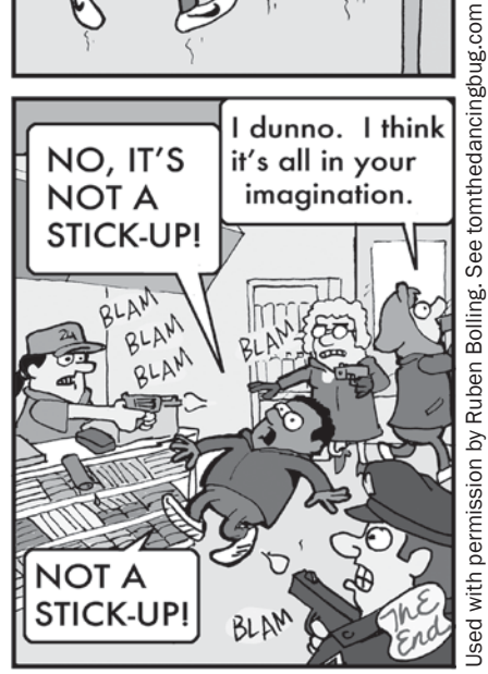
See <changeagent.nelrc.org/issues> for an ESOL lesson plan to accompany this. Subscription required. Also, see pp. 26-27 for more on "existing while black."