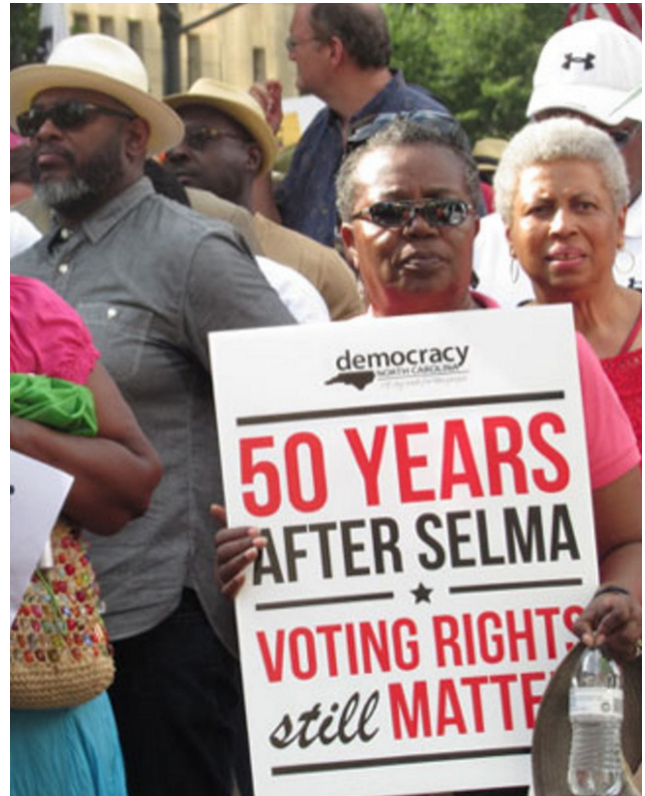
Residents in Winston Salem protested the passage of North Carolina House Bill 589. Photo courtesy of the Advancement Project.

from: < www.aclu.org/blog/speak-freely/north-carolinas-step-backward-democracy >