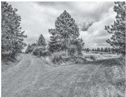
Right now, I have to choose a path going forward, and I don't know what to choose.

But I want to be a writer and tell my story. I want to share my struggles and my success.