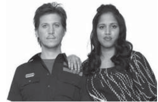
What is Generation Y? See p. 9