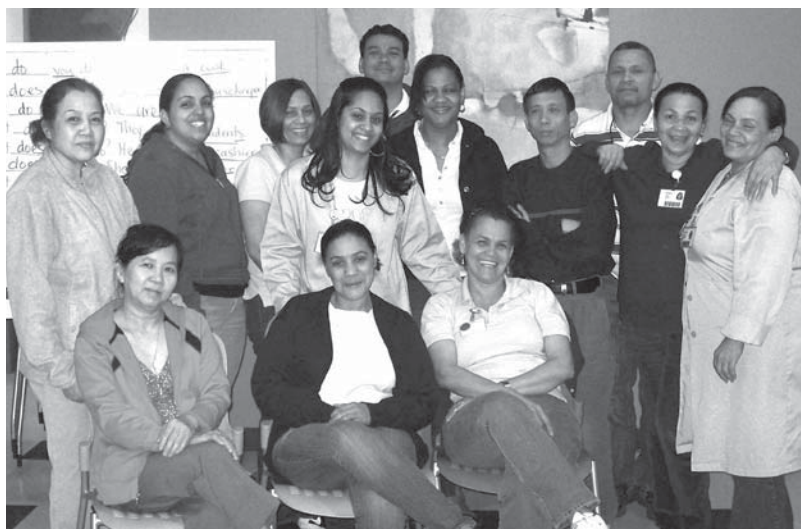
The Southwick workers in the Tuesday/Thursday class are from the Dominican Republic, Vietnam, and Korea.

of a coat or pants of a Brooks Brother's suit. In the afternoons, the cafeteria is transformed into a classroom with a portable dry erase board, easel and vocabulary flip chart. The employees turn in their smocks, needles, and thread for picture dictionaries and English conversation.