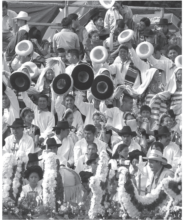
Indigenous people from Oaxaca participate in La Guelaguetza, 2005.

Unfortunately, the festival is very expensive. Tourists come from all over the world. The price to enter is very high. Only people with a lot of money can go. (Some tickets are free, but you have to wait in a long line to get them.) If you want to buy food or water at the festival, you have to pay a lot. If you want to sell anything at the festival, you have to pay a big fee to the authorities. Ironically, most Zapotecs cannot attend the festival. We do not have enough money. I have never attended it myself. I have only heard about it.