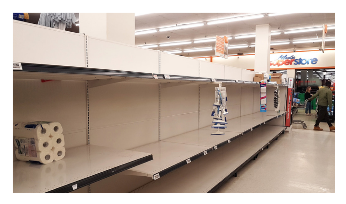
Empty grocery store shelves that were once filled with toilet paper.

should wear a mask, wash our hands, and clean the items we touch, like our phones. Consequently, people start panic buying. They hoard hand sanitizer, gloves, and masks. It's hard to find the things we need, like toilet paper and bleach. Now some people are storing a lot of these items, and