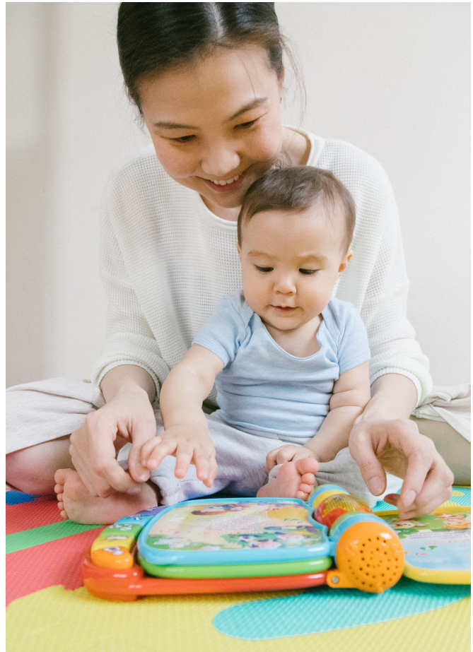
A woman and baby play together.

Being with my children is a blessing and brings me happiness, so I take the time to do it. I'm excited to see how much they grow and learn. I'm surprised at how much my children can do. That's why I so enjoy helping my children grow and learn.