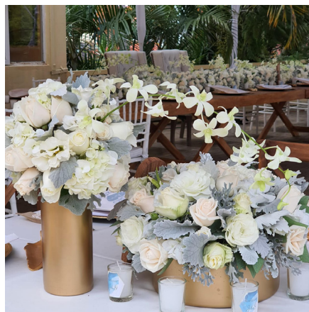
"We focused more on the decorations, so people on Zoom could see something beautiful."