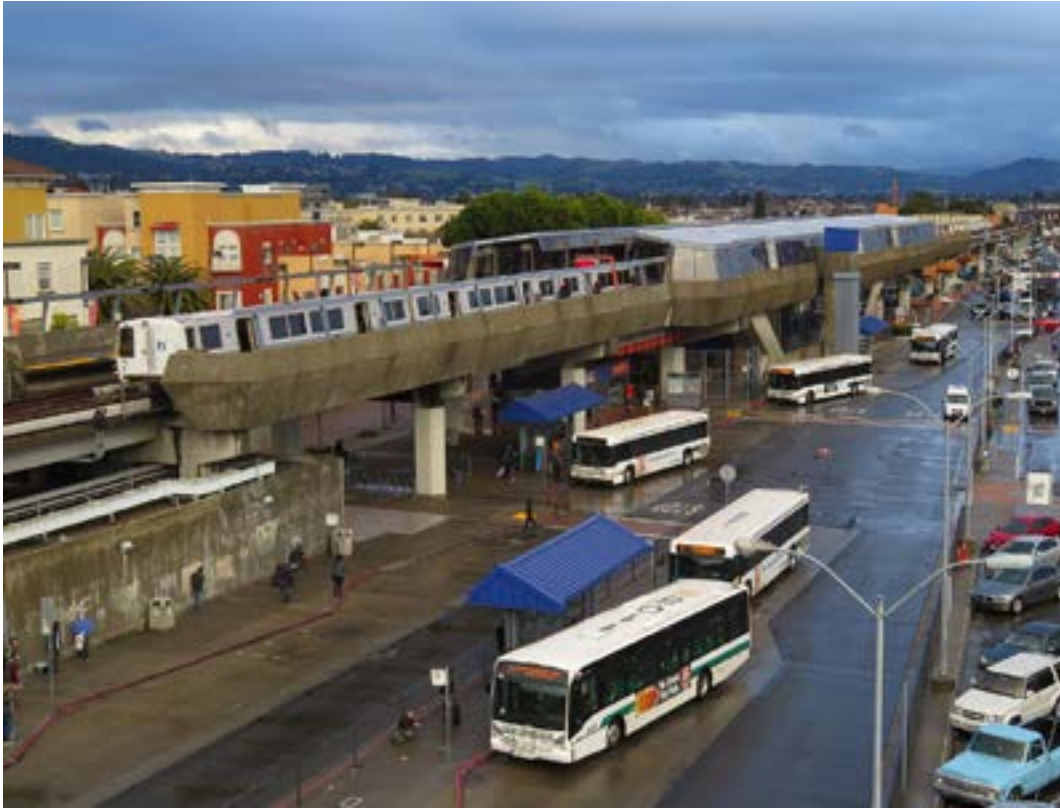
Fruitvale station and busway in Oakland California.

BEFORE YOU READ: Think about the phrase “to get lost.” Use it in several sentences. What strategies do you use to avoid getting lost?