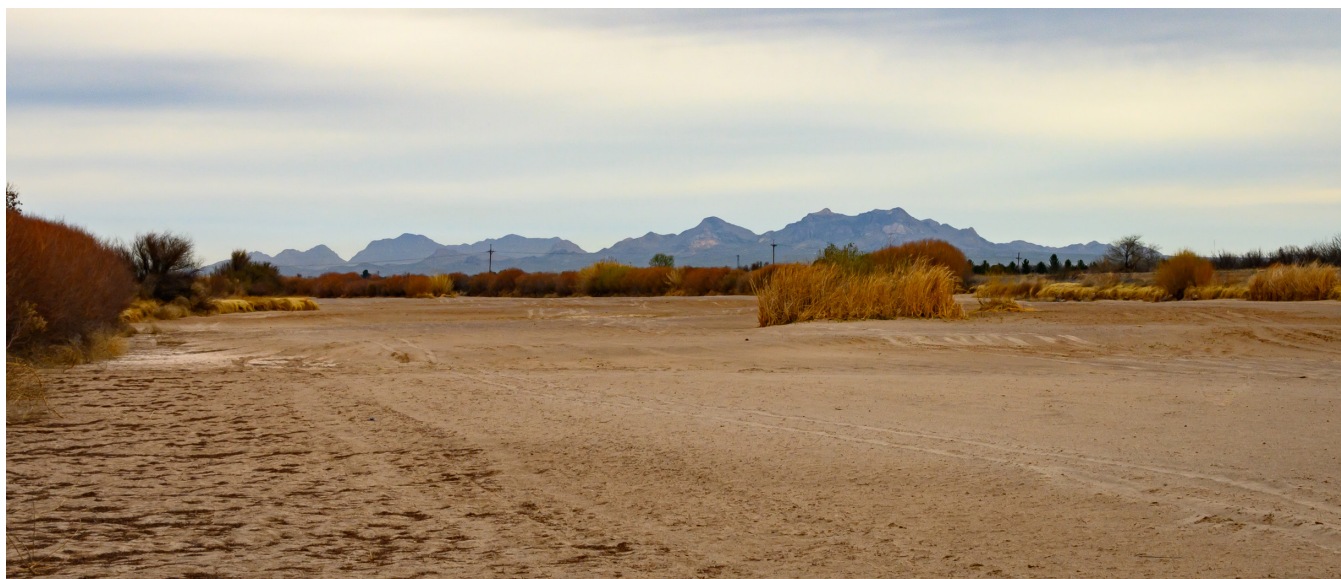
The dry river bed of the Rio Grande in Las Cruces, New Mexico. In Mexico, this river is called the Rio Bravo. Read more about it here: https://www.hcn.org/articles/climate-change-diverted-drained-and-dwindling-whats-the-fate-of-new-mexicos-rio-grande .

hua, Mexico, work on the land. They are in the same situation. They do not have a decent life. That's why they come to the U.S. as immigrants.